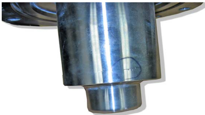
Rear casing breach caused by solids-laden vortices