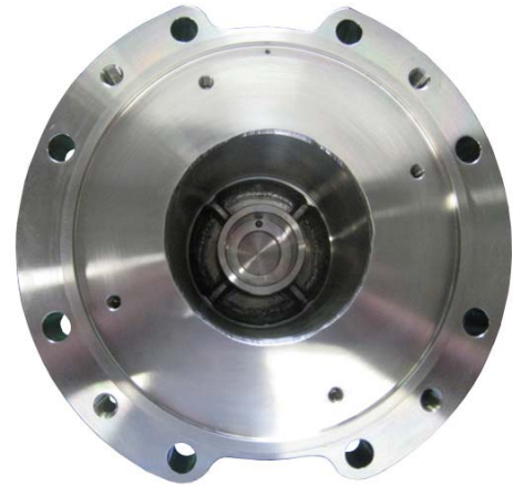
Rear casing with anti-vortex baffles

Many users of standard sealed, process pumps become frustrated with the high cost of frequent seal replacement and downtime when handling solids. A suitable flushing arrangement might help a sealed pump, but the advantages of sealless pumps are now available for many of these applications!